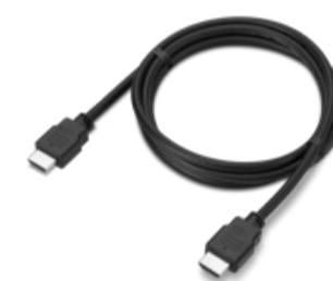
Lenovo Ultra High Speed HDMI™ Cable 1.8m