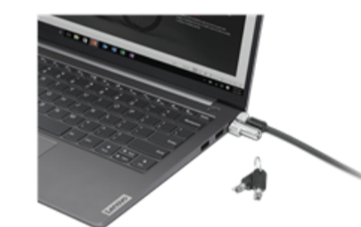
NanoSaver Cable Lock from Lenovo